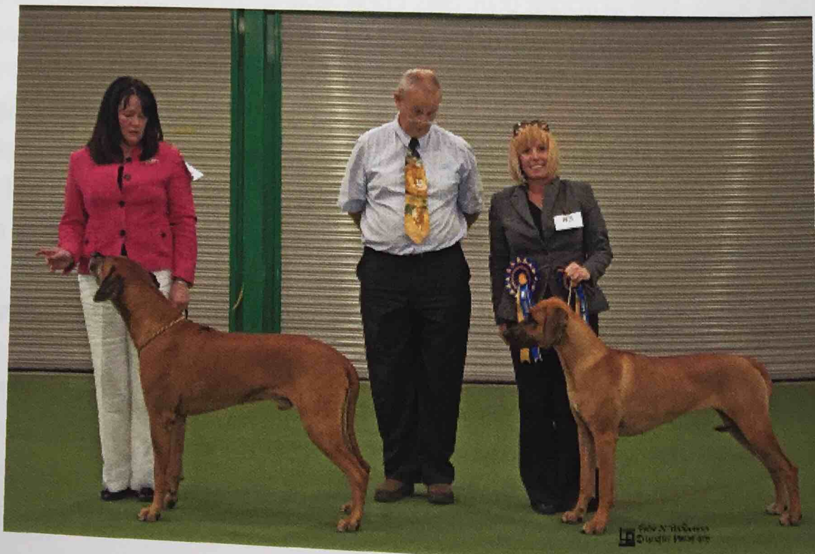
Best Veteran in Show (left) - Shingwidsi Tshepa Riva Best Puppy in Show (right) - Ilizulu Eye Candy