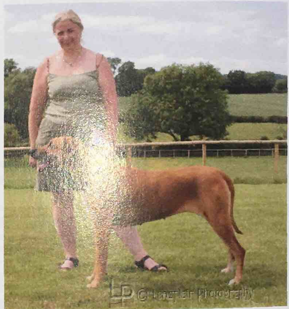
Best Veteran in Show : Rocksham Rio at Kylini

A wonderful day with some quality exhibits. I appreciated the consideration the Committee had given to the layout which gave a large ring in which the dogs could really get moving. My gratitude for the efforts of my stewards who kept things running smoothly which enabled me to fully concentrate on the job in hand! Thanks, also, for organising such wonderful weather!