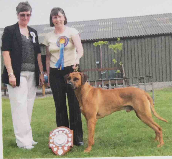
Best in Show : Walamadengie Chieftan