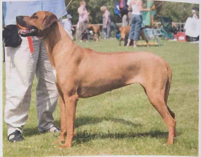
Reserve Best in Show : Isiqa's Galija