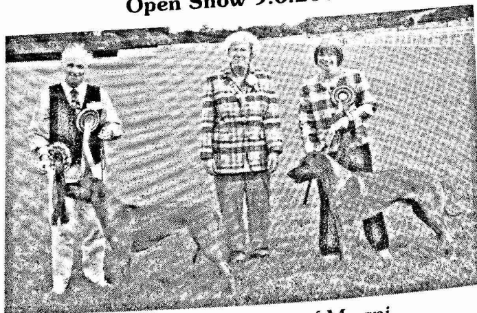
B.I.S.: Hespera Hasina of Mwani Res. B.I.S.: Flametrees Obeche at Khananga